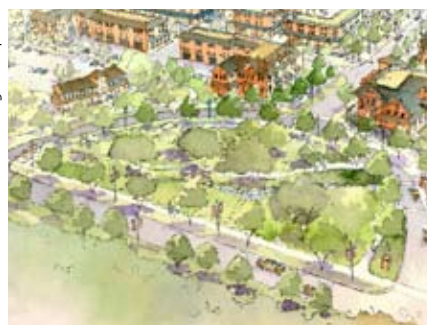
Illustration Credit: Hitchcock Design Group