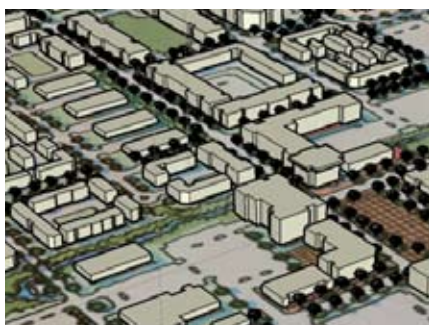
Illustration Credit: Hitchcock Design Group